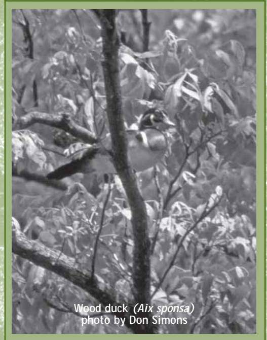
Wood duck ( Aix sponsa )

Arkansas Department of Parks & Tourism #1 Capitol Mall Little Rock, AR 72201 1-888-AT-PARKS